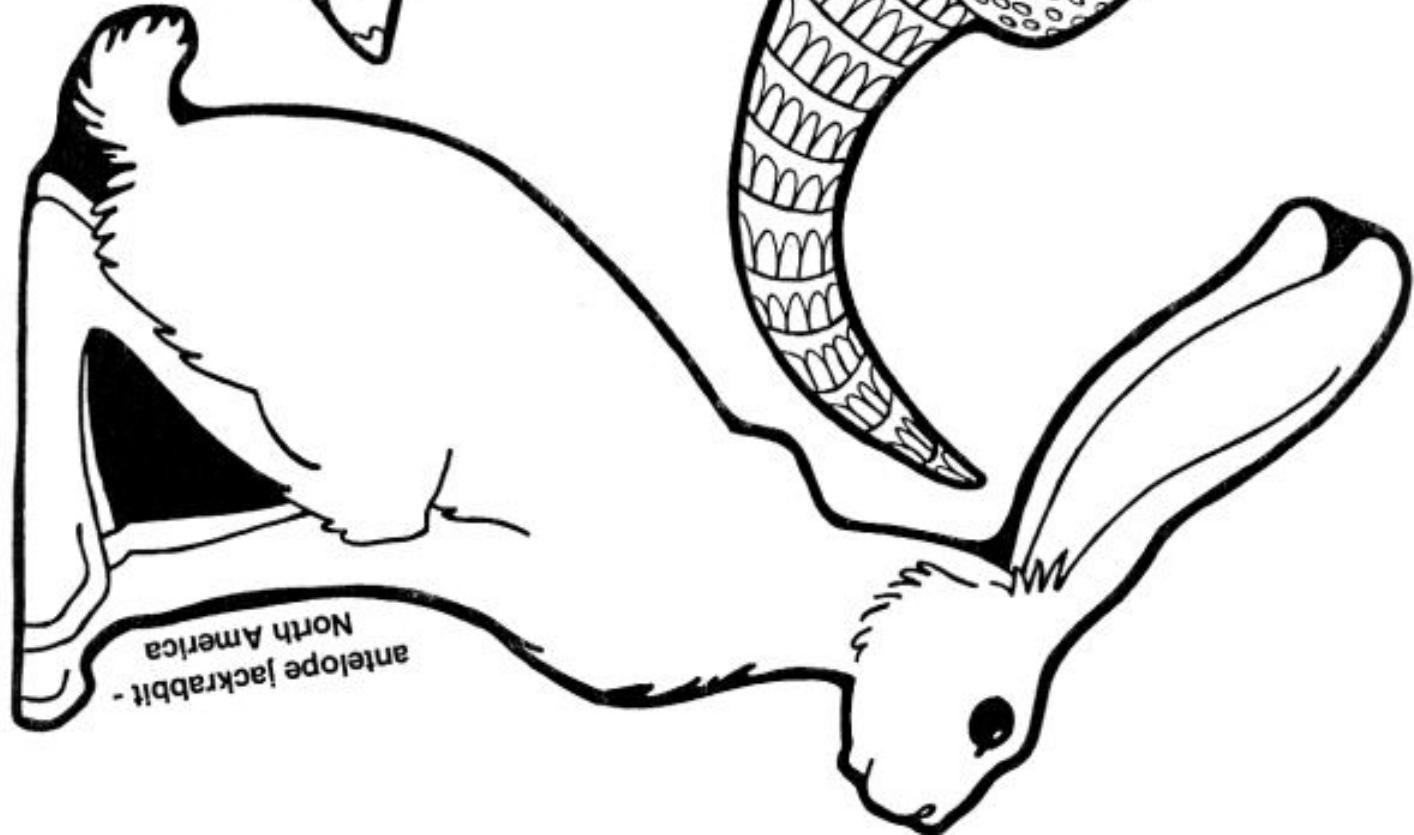
antelope jackrabbit - North America