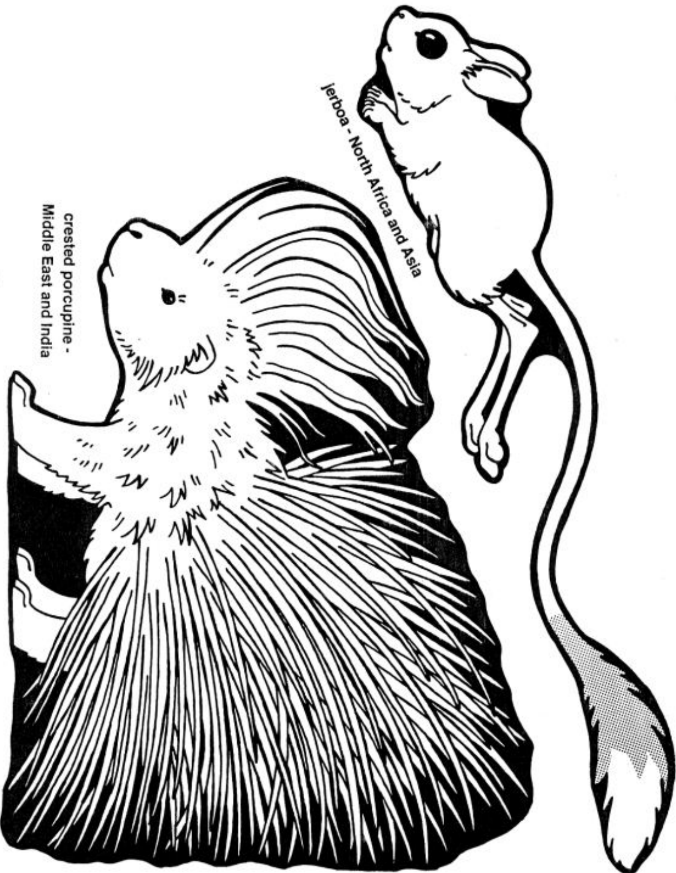
crested porcupine - Middle East and India