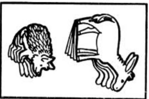
large shape books