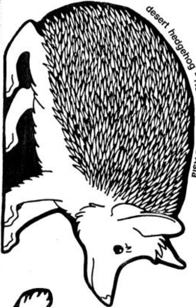
desert hedgehog - North Africa and Asia